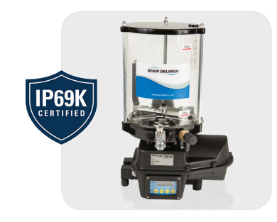
MultiPort II Lubricator

The MultiPort Lubricator is an electrically driven multiple outlet lubrication unit designed primarily for use with progressive divider valve systems to accurately control the amount of grease and to monitor system performance via an integral controller. IP69K rated to withstand the elements.