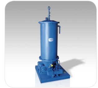
DC42 Pump Station

DC42 stations can supply either oil or grease to such installations as bar mills, billet mills, blast furnaces, and sintering machines. On DC42 systems, pressure is controlled by the reversing valve (DR45). The valve opens a micro switch, which stops the pump motor when system pressure rises to its setting. Timer controls for each type tailored to meet its specific requirements are available.