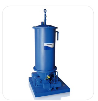
DC42 Central Station