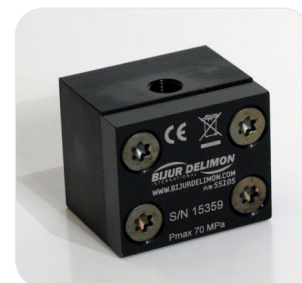
Lube Point Monitor (Part #55105)