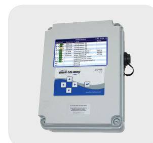
DS405 Lubrication Monitor