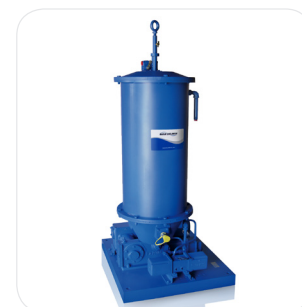
DC42 Central Station