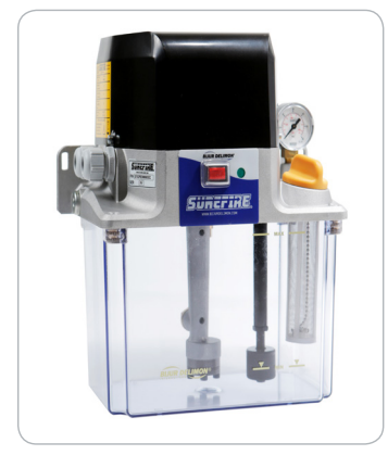
SureFire II with no Controller