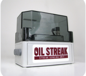
Oil Streak Sensor (Optional)