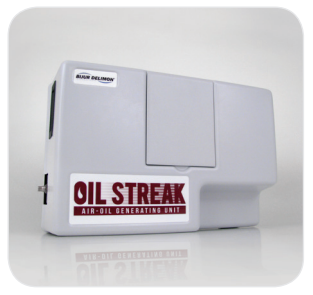
Optional Enclosure Available