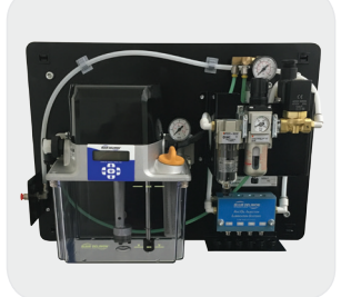
Oil Streak Panel