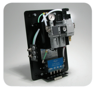
Oil Streak Generator Panel