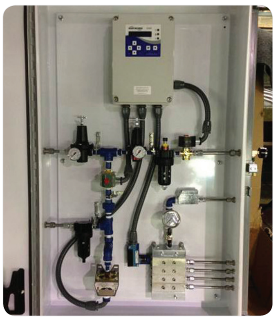
Automatic Grease System in Enclosure