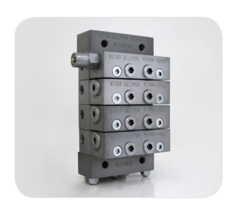
M2500G Block Standard with Zinc Nickel Coating (Optional SS Available)