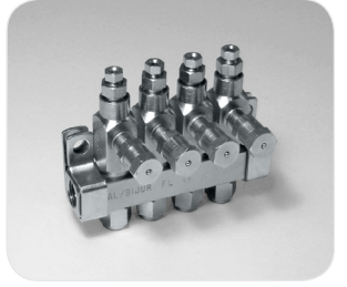
FL Injectors (Available in SS)