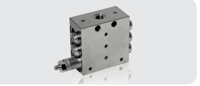
PVBM with Cycle Pin