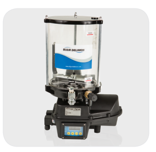
MultiPort II Lubricator

The MultiPort II Lubricator is an electrically driven multiple outlet lubrication unit designed primarily for use with progressive divider valve systems to accurately control the amount of grease and to monitor system performance via an integral controller.