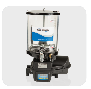
MultiPort II Lubricator

The MultiPort II Lubricator is an electrically driven multiple outlet lubrication unit designed primarily for use with progressive divider valve systems to accurately control the amount of grease and to monitor system performance via an integral controller.