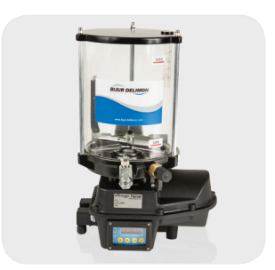
MultiPort II Lubricator

The MultiPort II Lubricator is an electrically driven multiple outlet lubrication unit designed primarily for use with progressive divider valve systems to accurately control the amount of grease and to monitor system performance via an integral controller.