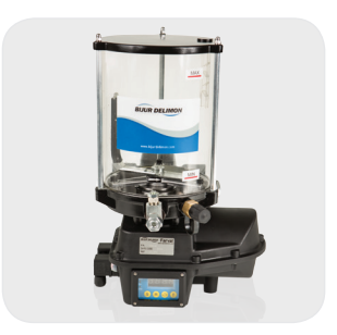
MultiPort II Lubricator

The MultiPort II Lubricator is an electrically driven multiple outlet lubrication unit designed primarily for use with progressive divider valve systems to accurately control the amount of grease and to monitor system performance via an integral controller.