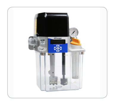
SureFire II with Controller