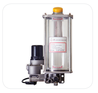
JS Series Lubricator

U-Block divider valves are specially designed for use in progressive lubrication systems. Several outlet configurations are available that allow you to tailor the divider valve to your lubrication specifications. Crossport bars are also available so you can double volume discharge where needed.