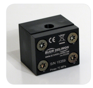
Lube Point Monitor (Part #55105)