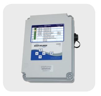
DS405 Lubrication Monitor