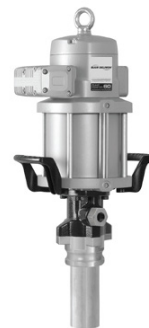
Bulk Tote PM Pump P.N. F531731