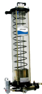
SKA881 Lubricator- Grease Version