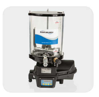
MultiPort II Lubricator

The MultiPort II Lubricator is an electrically driven multiple outlet lubrication unit designed primarily for use with progressive divider valve systems to accurately control the amount of grease and to monitor system performance via an integral controller.