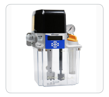
SureFire II with Controller