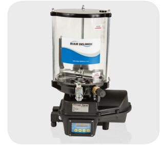
MultiPort II Lubricator

The MultiPort II Lubricator is an electrically driven multiple outlet lubrication unit designed primarily for use with progressive divider valve systems to accurately control the amount of grease and to monitor system performance via an integral controller.