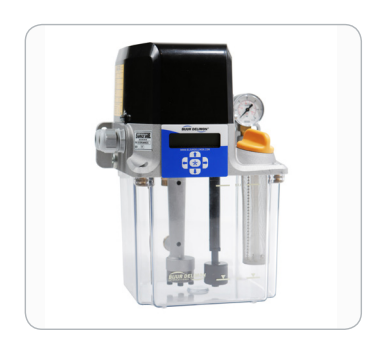
SureFire II with Controller