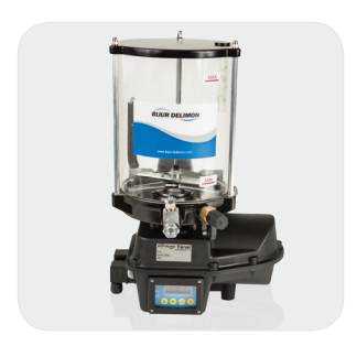
MultiPort II Lubricator

The MultiPort II Lubricator is an electrically driven multiple outlet lubrication unit designed primarily for use with progressive divider valve systems to accurately control the amount of grease and to monitor system performance via an integral controller.