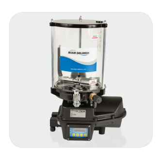
MultiPort II Lubricator

The MultiPort II Lubricator is an electrically driven multiple outlet lubrication unit designed primarily for use with progressive divider valve systems to accurately control the amount of grease and to monitor system performance via an integral controller.