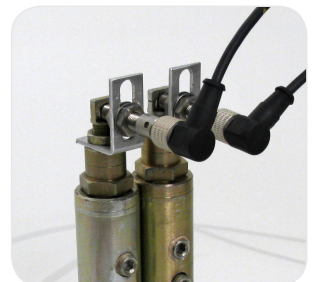
FL Indicator Pin Monitor

The FL PDI Indicator Pin Monitor utilizes high quality sensors with built-in LED's. The sensor will read movement of the FL PDI indicator pin. This ensures that lubricant has reached the FL PDI.