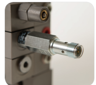
AC498-1 Proximity Switch

The AC498-1 can be retrofitted to any single progressive manifold with a 7/16 UNF thread to verify the correct number of cycles and volumes of lubricant were within your min/max range. Reduces bearing failures due to over/under lubrication, tracks the volume and time.