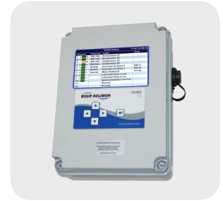
DS405 Lubrication Monitor

The DS405 is a completely new dedicated product for the monitoring of automatic oil or grease lubrication systems. Our new DS405 can be adapted to existing or new central lube applications. It records the total lubricant delivered to each bearing and provides the end user with reliable and accurate data.