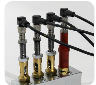
DD/DM Indicator Pin Monitor

The Dualine Indicator Pin Monitor utilizes high quality sensors with built-in LED's. The sensor will read movement of the Dualine indicator pin during each lubrication cycle. This ensures that lubricant has reached the Dualine Valve.