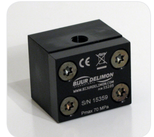
Lube Point Monitor (Part #55105)

The 55105 Lube Point Monitor is an accurate oval gear mechanism that incorporates two magnets into one of the nylon oval gears. Lubricant entering the 55105 causes the gears to rotate. Each pulse equates to an approximate displacement of 0.040 cu.in. (.65cc). The feedback from the 55105 will assure that lubrication has reached the inlet of the critical lubrication points.