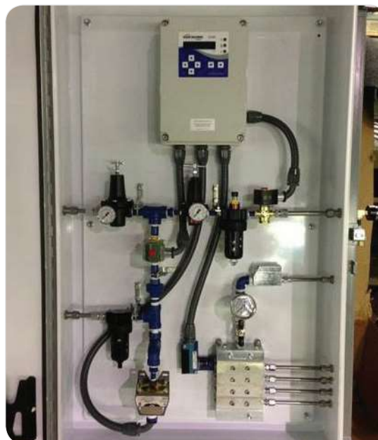
Automatic Grease System in Enclosure