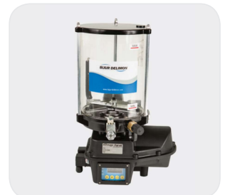
MultiPort II Lubricator