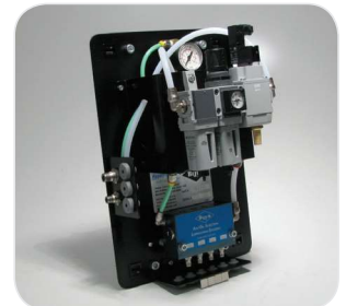
Oil Streak Generator Panel