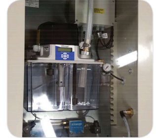
Air/Oil System in Enclosure